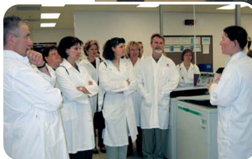
The guests listened intently to the presentations made in the laboratories.