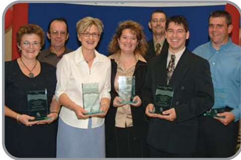
As a sign of recognition, a recipient presented a plaque to each of the 2002 bone marrow donors.

At a special function on the evening of September 27, Héma-Québec recognized the courage and generosity of seven bone marrow donor registrants who made a donation in 2002. This very successful event was an initiative of the Bone Marrow Donor Registry department.